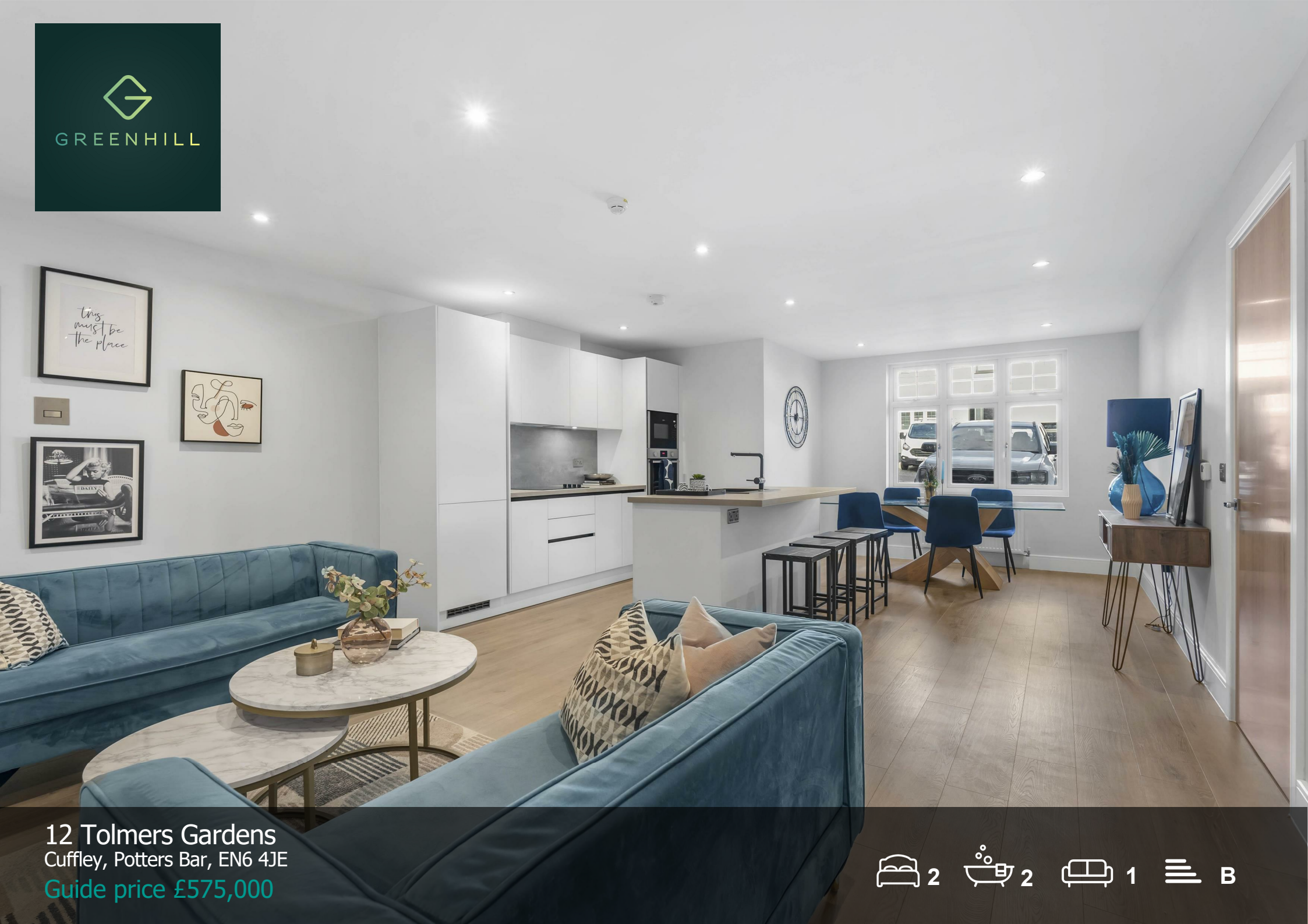
12 Tolmers Gardens Cuffley, Potters Bar, EN6 4JE Guide price £575,000